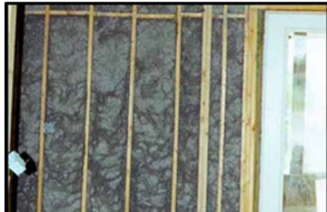
Basement wall insulation

The presence of roughed in walls should reduce the cost listed in the report.