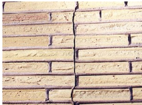
Fireplace air leakage

The homeowner has not experienced problems with drafts. There are indications that air is infiltrating through the walls and up through the attic insulation, reducing the insulation's effectiveness. An air seal-up would increase insulation effectiveness as well as reduce infiltration heat loss.